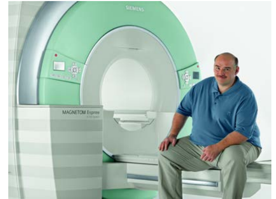
Table can handle up to 500 lbs!

We accept all major insurances, Worker's Comp, accidents, and self-pay!