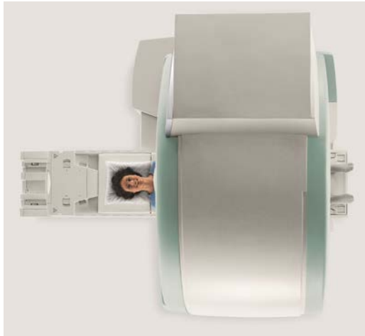
Feet first, head out!

For many exams, your feet go in first and your head remains outside of the system. That has never been possible before in Open MRI. But most important of all, the power is 3 times greater than the conventional Open and assures that you get the most confident diagnosis.